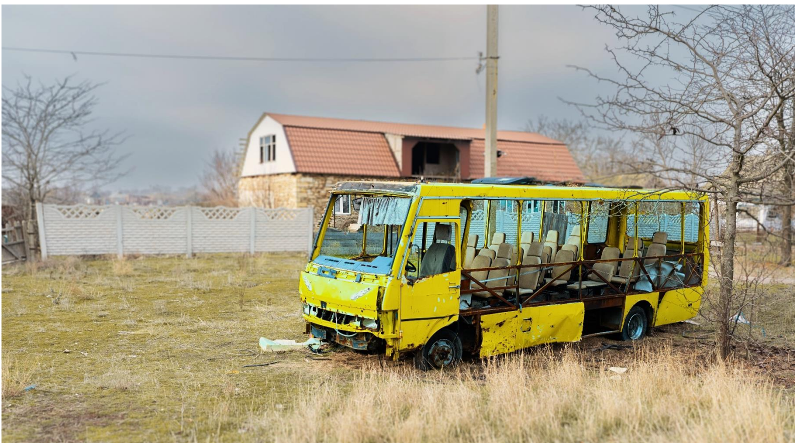
28 November 2023 — Kherson oblast, Ukraine A shelled school bus. The remote village in Kherson region was on the frontline for many months.

Recognizing the unique circumstances of each participant, but aiming to provide a broader perspective, this chapter outlines the most common scenarios, categorizing them based on the key motives behind participants' decisions. While some characteristics may overlap, the goal is to offer the most thorough analysis possible.