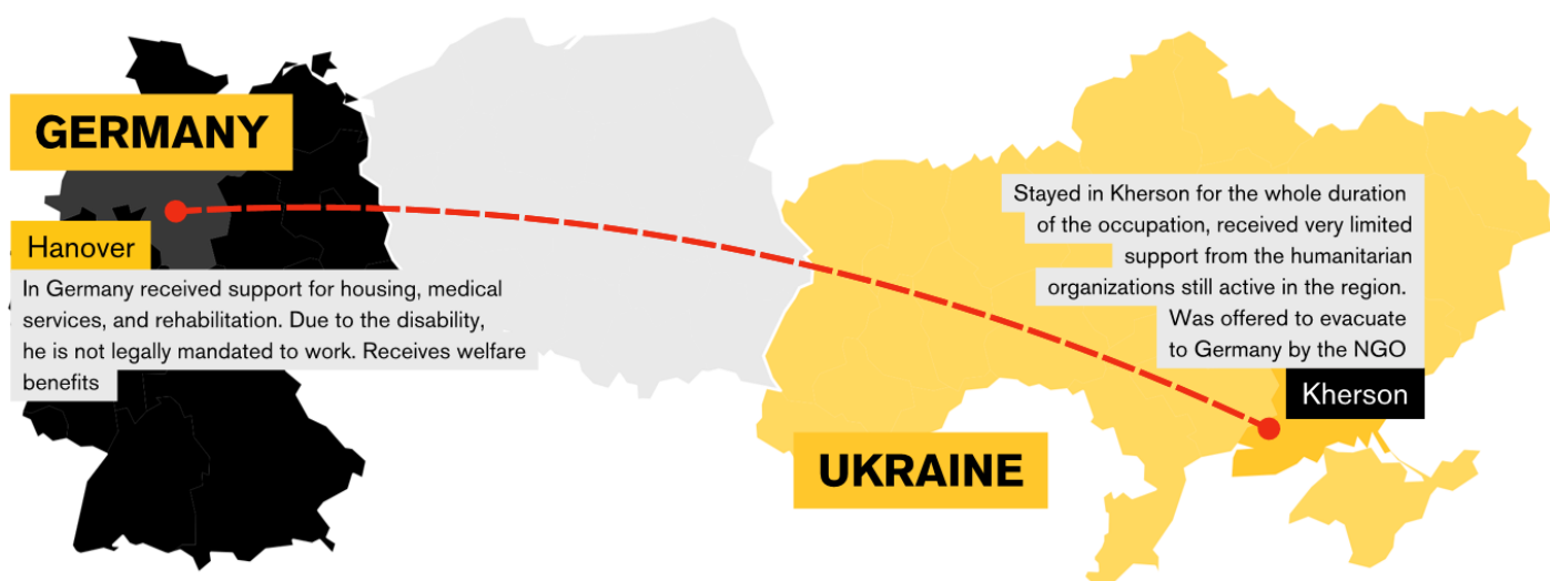
Refugee from Kherson, Germany (Male, 38)