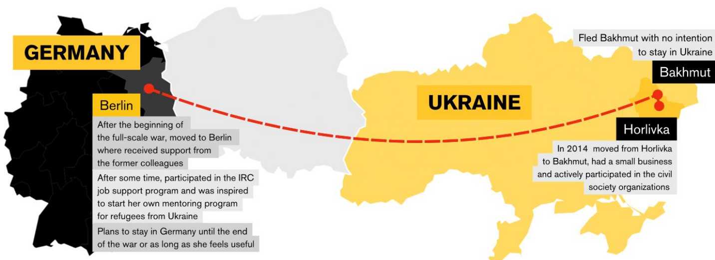
Refugee from Bakhmut, Germany (Female, 46)

Her previous experience and connections to civil society organizations have been instrumental in this pursuit. Although she remains engaged with Ukraine, she does not plan to return for now, as she feels useful and professionally fulfilled in Germany.