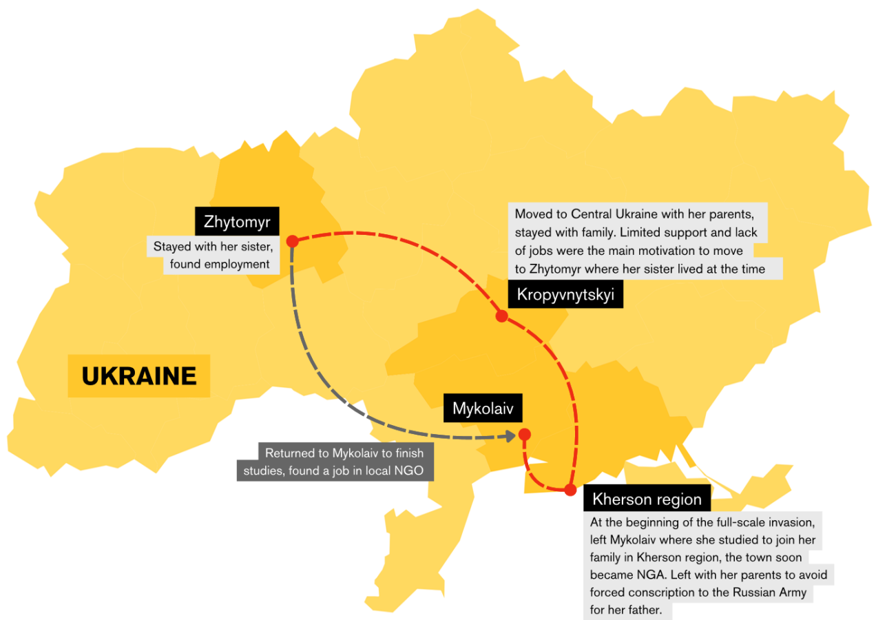
IDP's journey from/to Mykolaiv. (Female, 21) Source: own elaboration

A 21-year-old woman was studying in Mykolaiv when the full-scale war began. A few days into the invasion, she decided to reunite with her parents in the Kherson region, which was soon occupied and became a non-government-controlled area (NGA).