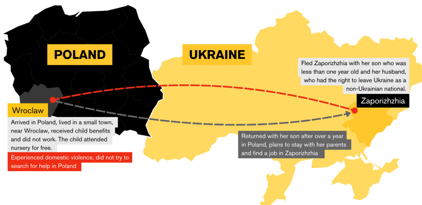
Returnee journey from Zaporizhzhia (Ukraine) to Poland and back. (Female, 30)

A 30-year-old woman from Zaporizhzhia left her hometown with her husband, who was exempt from the martial law as a non-Ukrainian national, and newborn son following the outbreak of the full-scale war. The family settled in a small town near Wrocław, Poland, where she did not work but relied on child benefits, which she highly valued. Her husband, despite not being Ukrainian national, benefitted from the temporary protection in Poland and secured a full-time job.